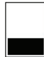
1/3 PAGE H