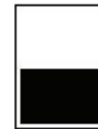
1/2 PAGE H