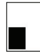
1/4 PAGE V