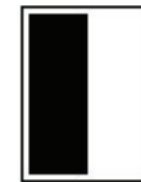
1/2 PAGE V