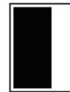
2/3 PAGE V