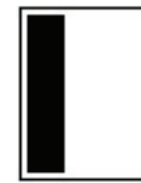
1/3 PAGE V