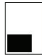
1/4 PAGE H